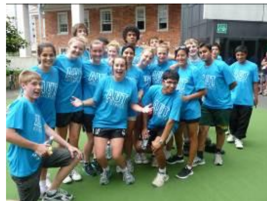
2012 Student Leaders at AUT Campus