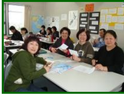
Adult students happily engaged in their learning

Opportunities for more advanced learners to do senior mainstream subjects in the college, the MYOB business course and NCEA unit standards. All students have option choices to equip them for life in New Zealand. We organise regular trips to places of cultural and general interest. We provide opportunities to make lasting friendships.