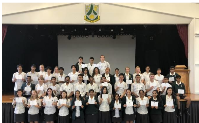
2019 Level 1 Excellence Endorsement