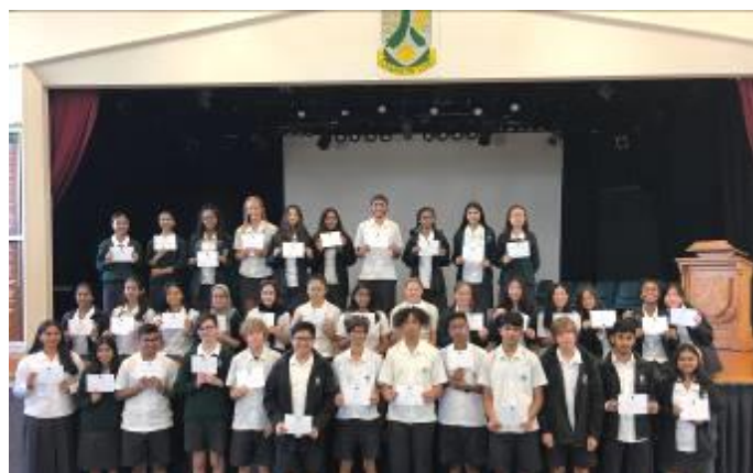
2019 Level 2 Excellence Endorsement